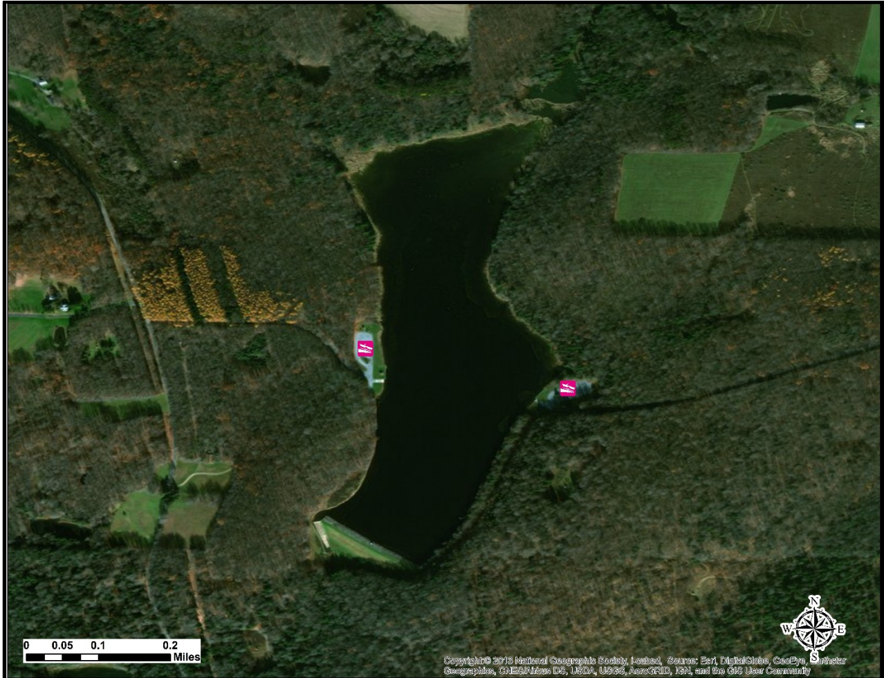
Aerial photo of Straight Run Lake, Indiana County.

May 2018 Night Bass Electrofishing Survey