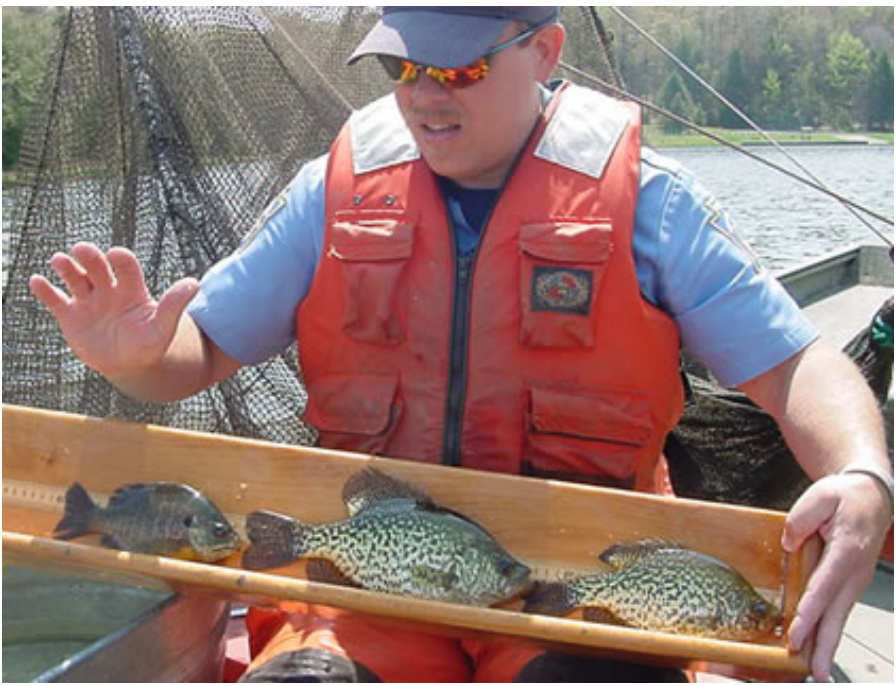
Hemlock Lake panfish

populations reflect the small size and infertile nature of Straight Run Lake. Large gamefish include largemouth bass, northern pike and saugeye. The panfish fishery consists primarily of black crappies, bluegills, pumpkinseeds and brown bullheads plus a few rock bass and yellow perch. Other species captured consisted of golden shiners and white suckers.