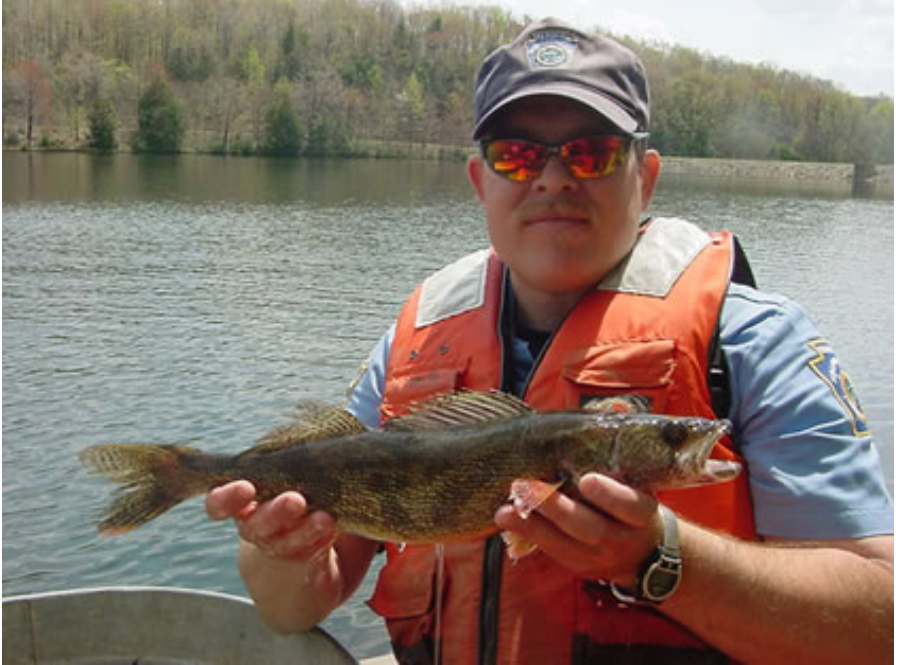
Hemlock Lake saugeye

We captured 2 saugeye at 18 and 19 inches in length. This low capture rate suggests we need to switch to stocking more readily available walleye fingerling to build a more reliable/dense walleye population that anglers will target.