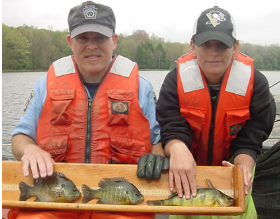
More Hemlock Lake panfish

Straight Run Lake is set in beautiful surroundings and provides the opportunity to harvest a few panfish and catch some largemouth bass and northern pike. Anglers wanting to avoid crowds and willing to get off the main roads should enjoy fishing this lake.