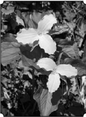
Trillium in bloom