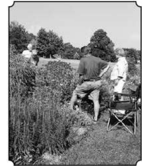
Blue Spruce Gardens