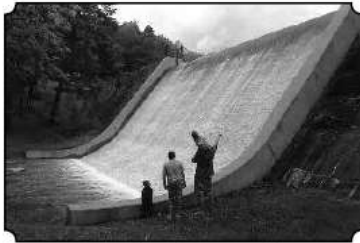
Cummings Dam at Blue Spruce Park